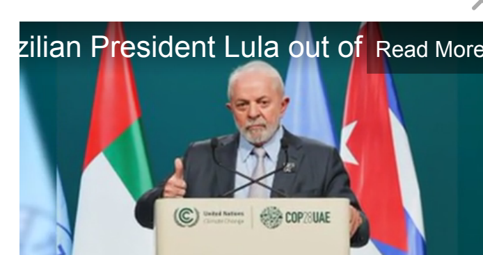
Brazilian President Lula out of office. Read More