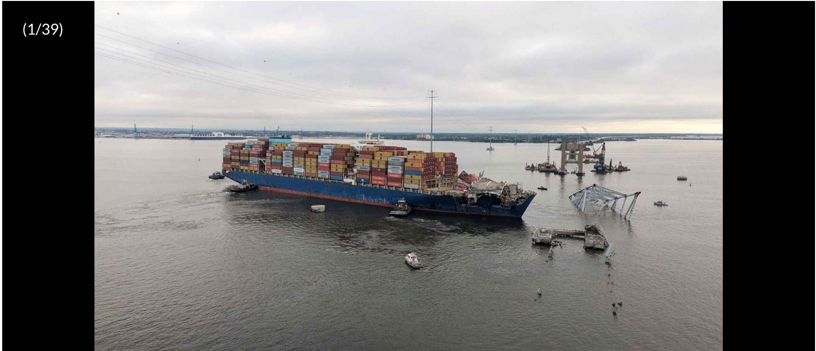
The recovery from the deadly Baltimore bridge collapse reached a significant milestone, as the ill-fated container ship Dali was slowly ... See full caption

bridge collapse | dundalk | john domen | key bridge